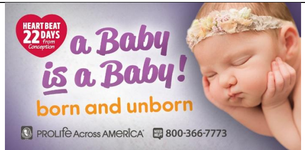
Baby Anastasia 2