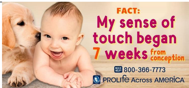
Sense Touch Ignatius 5