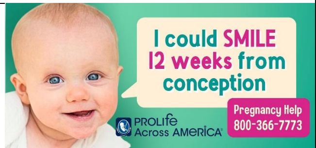
Smile Aoife 6