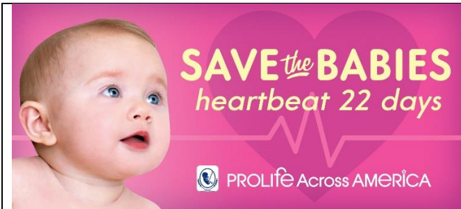
Save Adeline 1

Note: The phone number is taken off the design before printing.