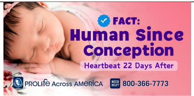
Fact Perpetua 4